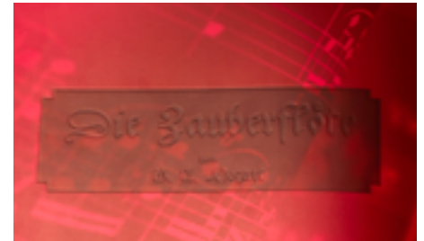
On-press textured effects simulate conventional embossing, producing creations that are unique and stand out.

Use HP SmartStream products and partner solutions with the HP Indigo 7600 Digital Press to improve production efficiency and support digital growth. To learn more visit hp.com/go/smartstream