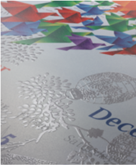
Raised print produces eye-catching, tactile effects that can turn an ordinary application into the extraordinary.