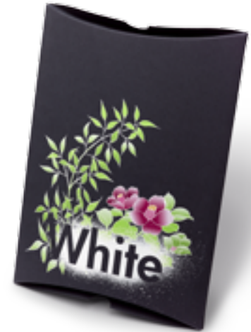
Create dramatic effects using HP Indigo ElectroInk White, on black and dark substrates.

Inline and near line finishing. HP Indigo Direct2Finish finishing automation, near-line or in-line, reduces make-ready, turnaround time, waste and errors with automated finishing setup and operation. Solutions include the Duplo UV coater and CP Bourg booklet maker.